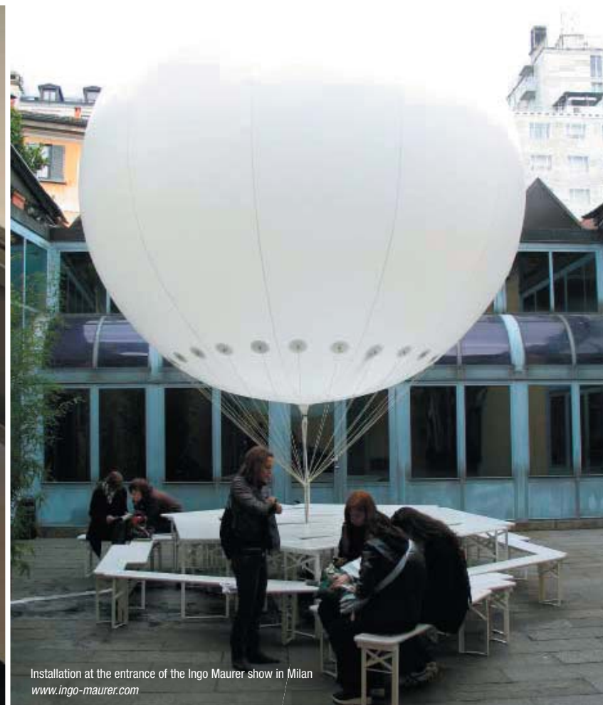
Installation at the entrance of the Ingo Maurer show in Milan www.ingo-maurer.com