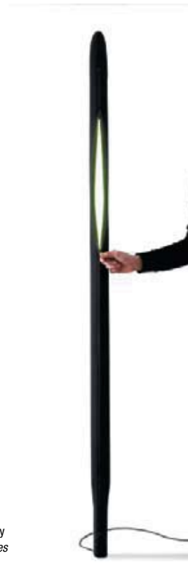
Stripped Light , is a floor lamp inspired by a standard table lamp. Stripped of its lampshade it spends a crystal clear light, while at the same time spreading an atmosphere of subtle comfort. Switched off it reveals its natural interior details. Design: Tina Roeder www.tinaroeder.com